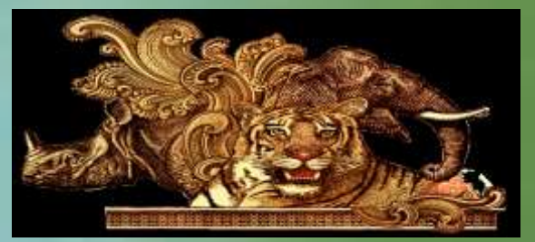
Issuer of Currency